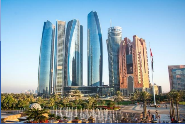
Abu Dhabi, UAE