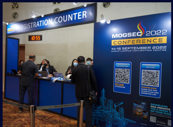
Platinum - Registration counter