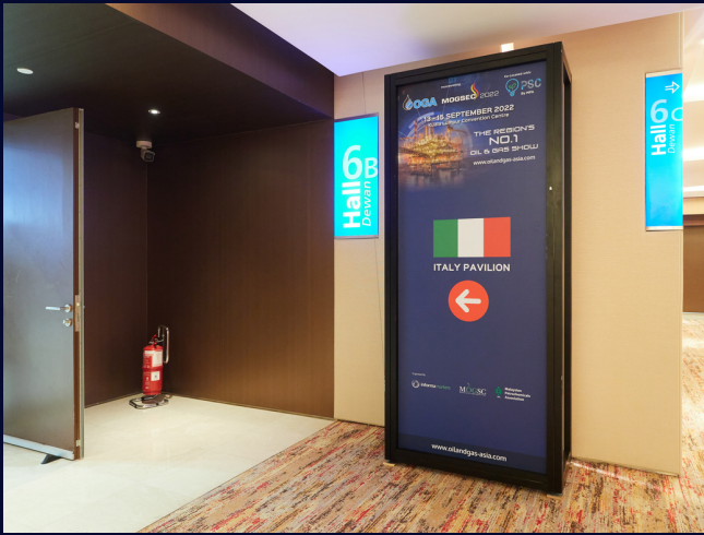
Silver - Lighted Stand