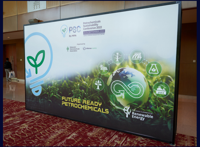
Gold - Sample Photowall