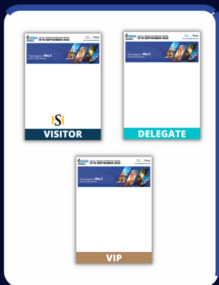
Platinum - Badges