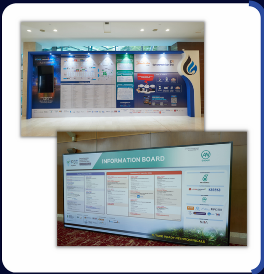
Gold - Infoboard