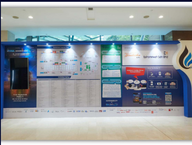
Gold - Infoboard