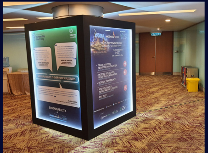
Gold - Lighted Box Pillar