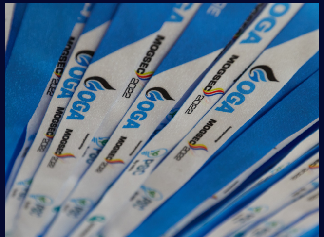
Diamond - Lanyard