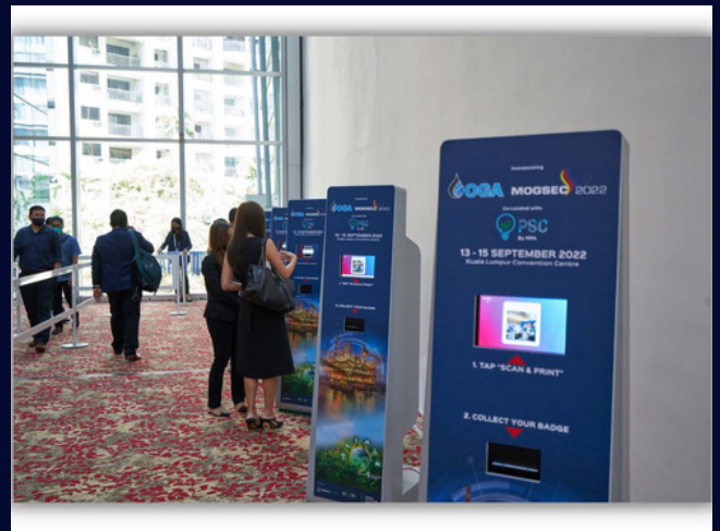
Platinum - Registration counter