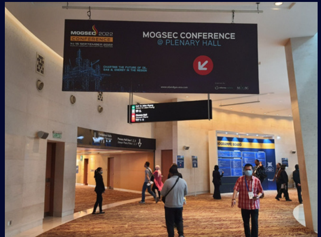
Diamond - Hanging Banner