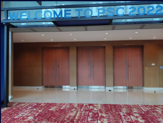
Diamond - Entrance Arch, LED